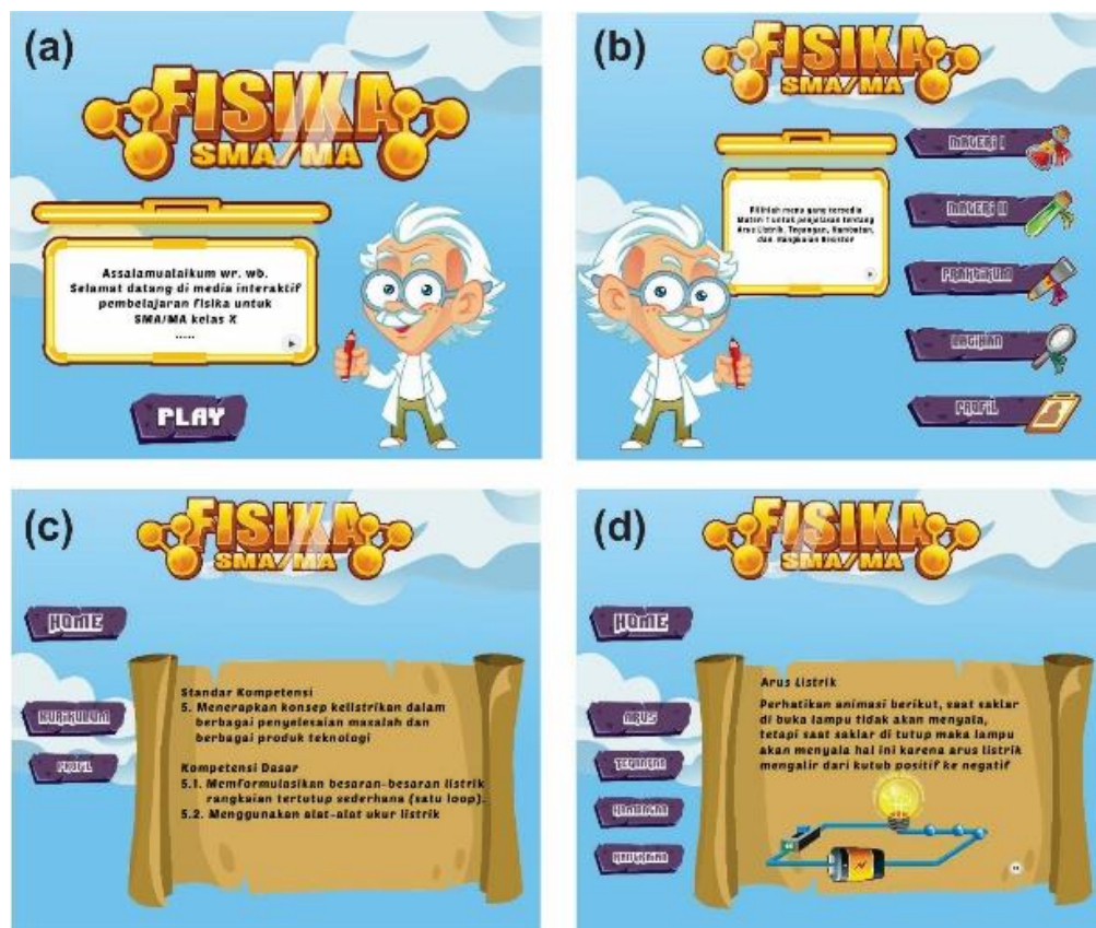
Figure 2. Display of ITMA: Introductory Page (a); Menu Page (b); Curriculum Pages (c); and Content Pages (d)

ITMA was developed using Adobe Flash Professional CS6 is combined with the tutorial method, so that students are expected to be able to learn independently. The ITMA developed not only contains information about the material but also contains experimental animations and questions for the dynamic electrical material competency test. It may be claimed that Adobe Flash is appropriate multimedia because the information included in Adobe Flash is encoded in two modalities, visual and auditory, referred to as double coding (Astuti & Nurcahyo, 2019). In addition, the analysis of assessments from experts and student responses will also be discussed. The display of ITMA products is shown in Figure 2.